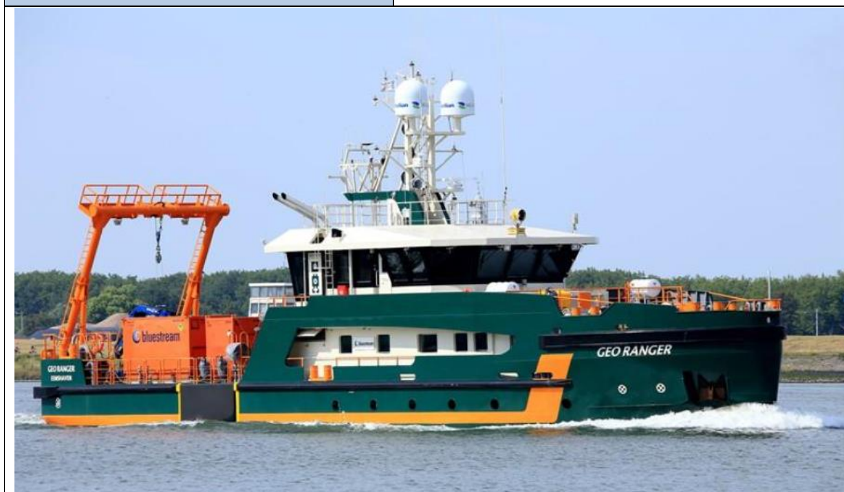
Table 2 – Survey Vessel Geo Ranger.