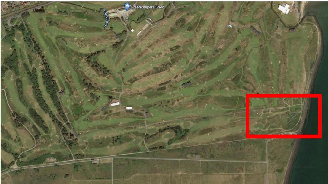
Fig 2 – Landfall works area located at Carnoustie Barry Golf Links.

Works continue at the export cable landfall site on the inner sheet piled cofferdam, these works involve construction of a temporary piling platform. Once the inner cofferdam is in place this will then allow the excavation and installation of cable ducts, cement bound sand and final backfill. The landfall works area is shown below in Fig 2.