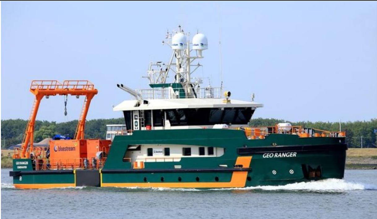
Table 2 – Survey Vessel Geo Ranger.